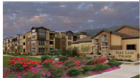
Park Lane Village Apts. 324 units