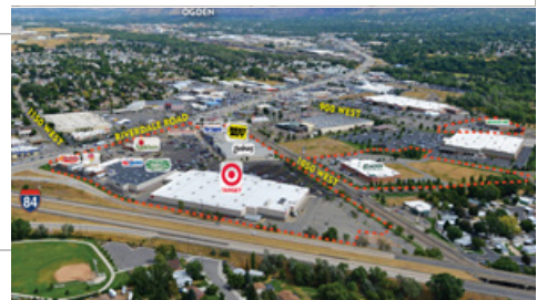
Family Center at Riverdale 427,805 sq. ft.