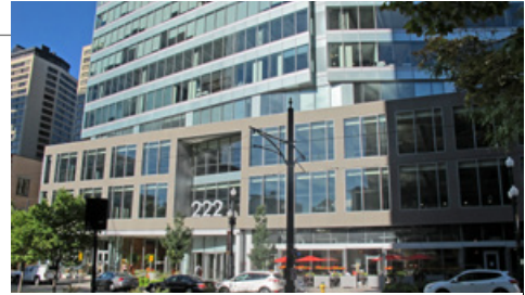
222 Main 426,657 sq. ft.