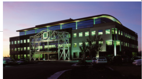
Ninigret Office Building 244,961 sq. ft.