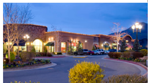
Shops at Riverwoods 186,677 sq. ft.