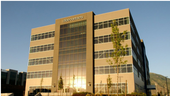
1-800Contacts 125,000/176,000 sq. ft.