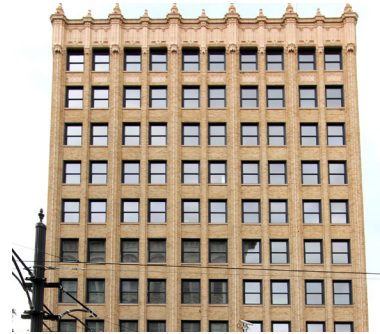
Neumont University (HQ) 68,000 sq. ft.