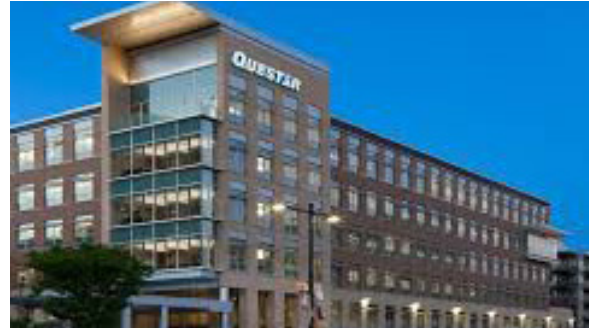
Questar Corporation (HQ) 175,000 sq. ft.