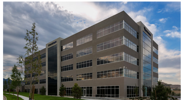
StorageCraft (HQ) 125,000 sq. ft.